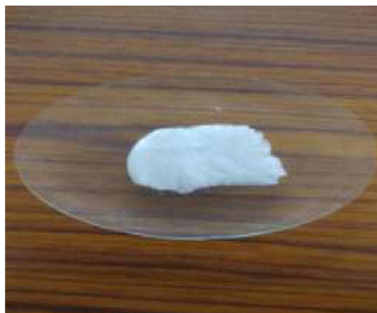
Fig: Formation of Crystals of Potash Alum Crystal of Potash Alum